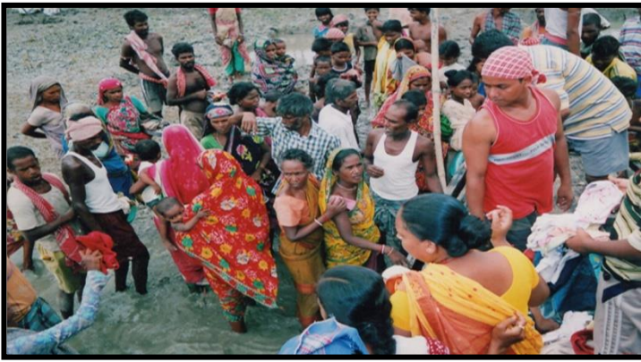
Medicine, Dry Food, Cloths & Water Pouch Distribution on AILA, 2009