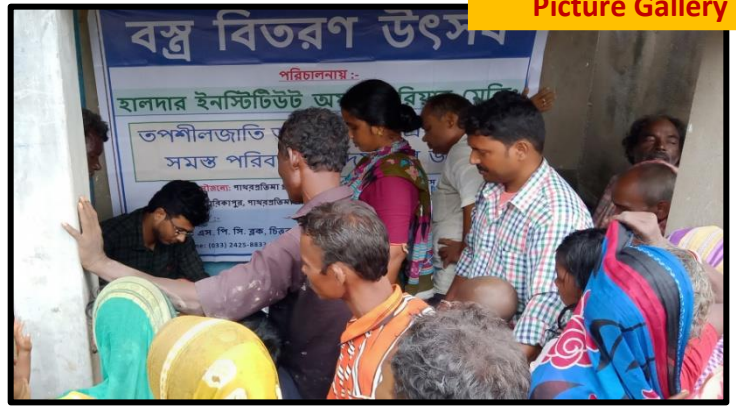
Cloth Distribution for Adiwasi Society (ST) at Pachim Dwarikapur, Patharpratima Block, South 24 Pgs.