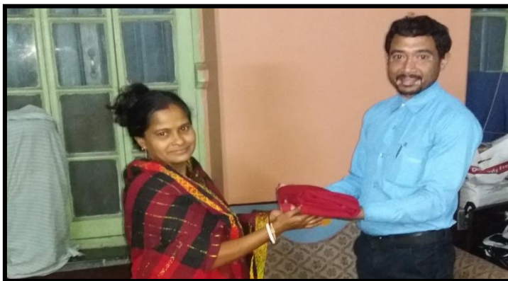
Cloths & Books Distribution