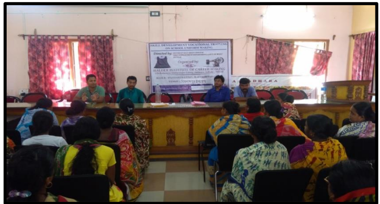
Awareness Camp for Tailoring cum School Uniform Making Training Program under SHG & SE Deptt. Govt. of W.B.