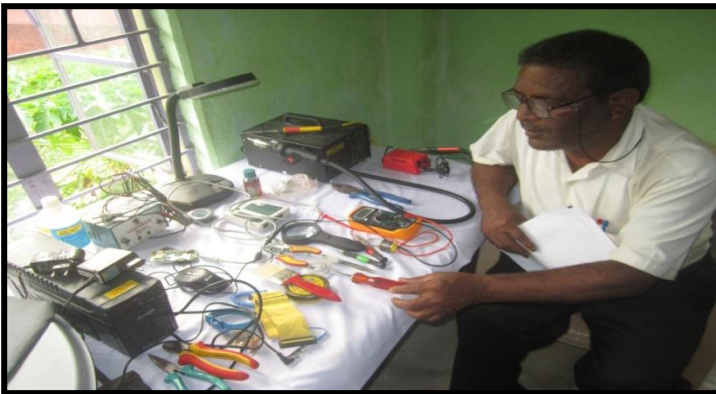
An Inspection for Technical Vocational Training under NCVT, Govt. of IND