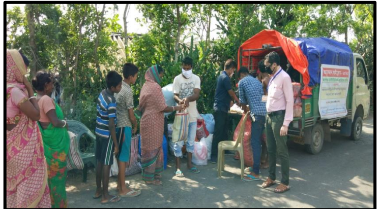
Cloth & Food Distribution for Amphan Cyclone at Hingalganj, North 24 Pgs.