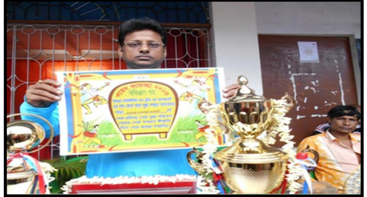
Para Puja Award on Durga Puja at Kolkata