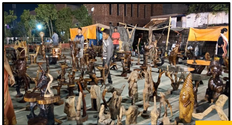
Exhibition Survey on West Bengal State Hostoshilpo Mela, Govt. of W.B.