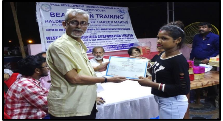
KMC Ward No. 92 Certificate Distribution on Beautician Training Program under WBSCG Govt. of W.B.