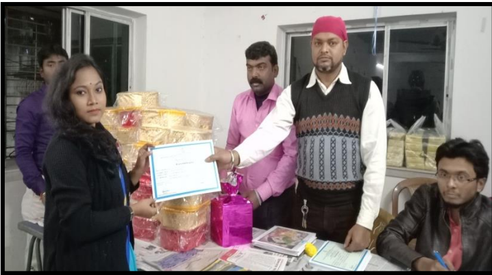
Certificate Distribution on Beautician Training under SHG & SE Deptt. Govt. of W.B.