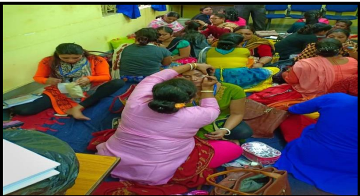
Beautician Training under SHG & SE Deptt., Govt. of W.B.