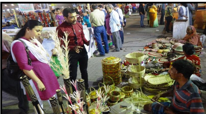
Survey on Hasto Shilpo Mela Exhibition at West Bengal