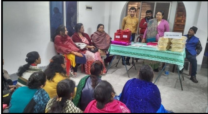
Certificate Distribution on Beautician Training under SHG & SE Deptt. Govt. of W.B.