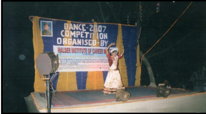
Dance Competition on Saraswati Puja