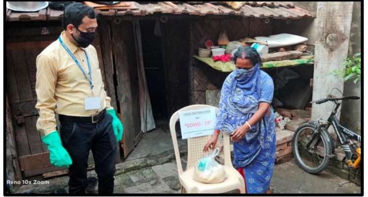
Food Distribution during the "COVID-19"