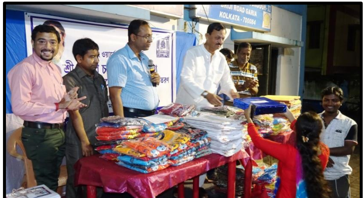
KMC Ward No. 110 Certificate Distribution on Beautician Training Program under WBSCG Govt. of W.B.