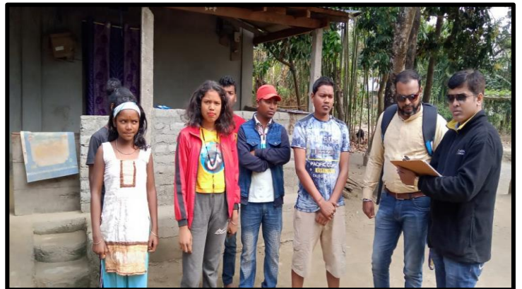
Survey on Mujnai Tea Garden, Birpara Madarihat Block, Alipurduar