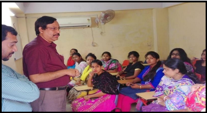
An Inspection for Beautician Training under MSJEN, Govt. of IND