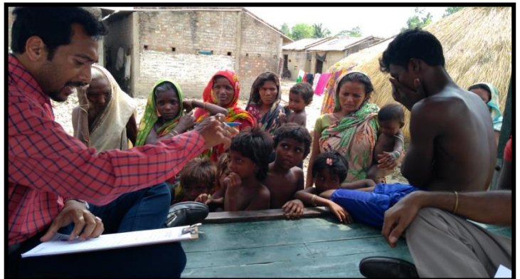
Community Survey on ST area at Aliporeduar