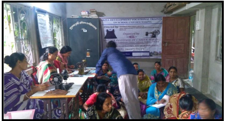
Tailoring Training under SHG & SE Deptt., Govt. of W.B.