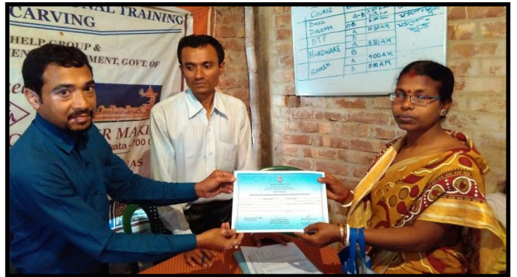
Certificate Distribution on Stone Carving Training under SHG & SE Deptt. Govt. of W.B.