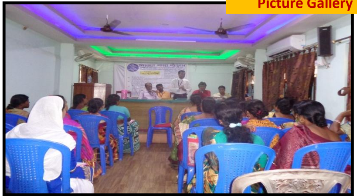
A Seminar on School Uniform Making Training under SHG & SE Deptt. Govt. of W.B.