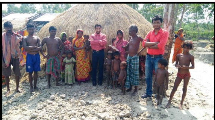
Community Survey on SC & ST area at South 24 Parganas and North 24 Parganas